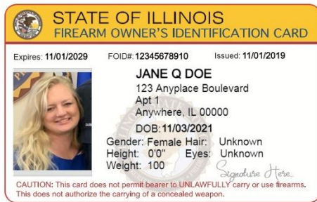
Current FOID Card