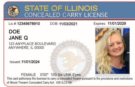
Current Concealed Carry License