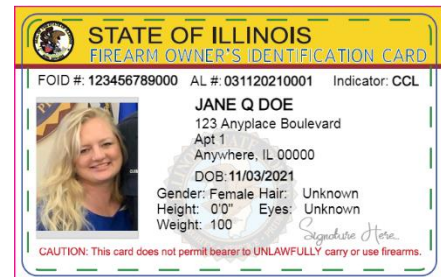
Example New Combined Card