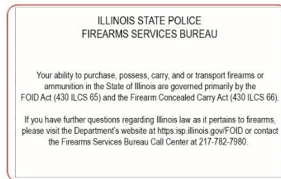
Reverse Side New Card Stock