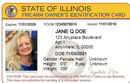
Current FOID Card