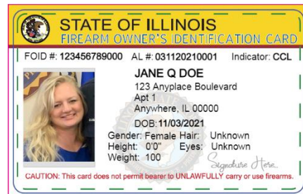
Example New Combined Card