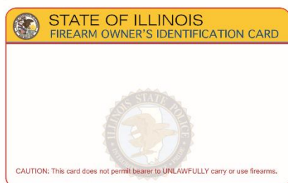
Front Side New Card Stock