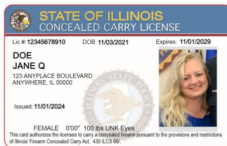
Current Concealed Carry License