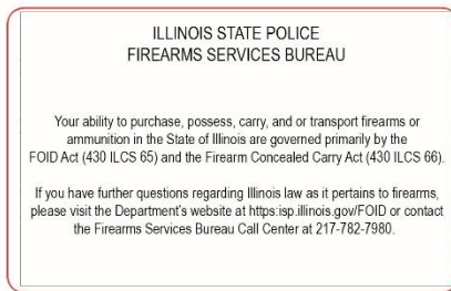
Reverse Side New Card Stock